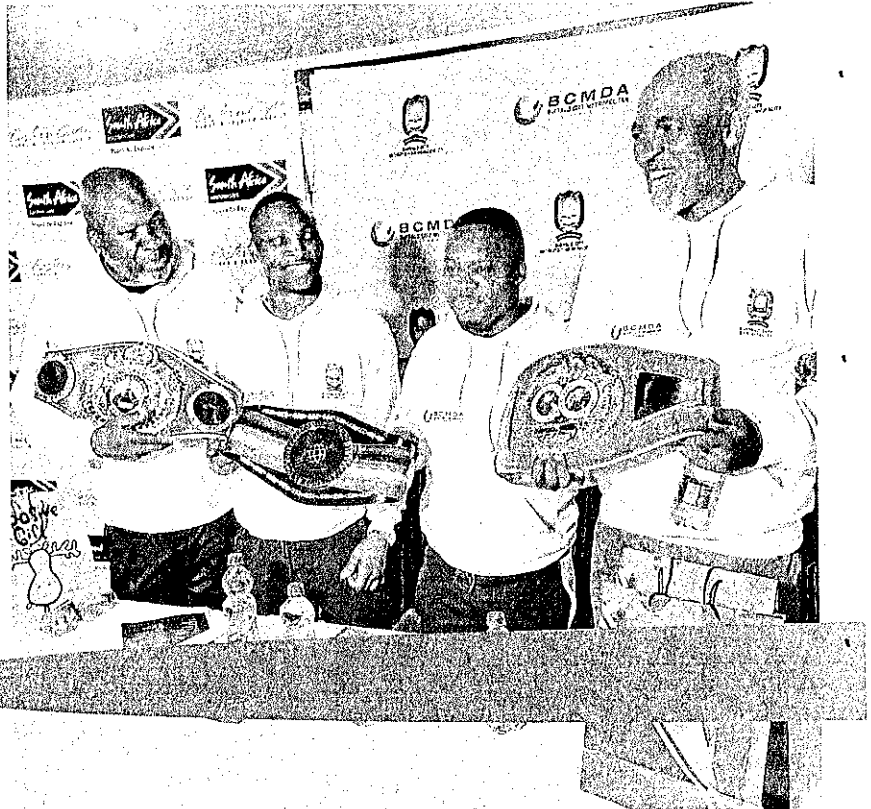
Zolani Tete, second from left, and his team show off the belts he won at Wembley Stadium in London on Saturday night during his welcome ceremony in East London on Monday.