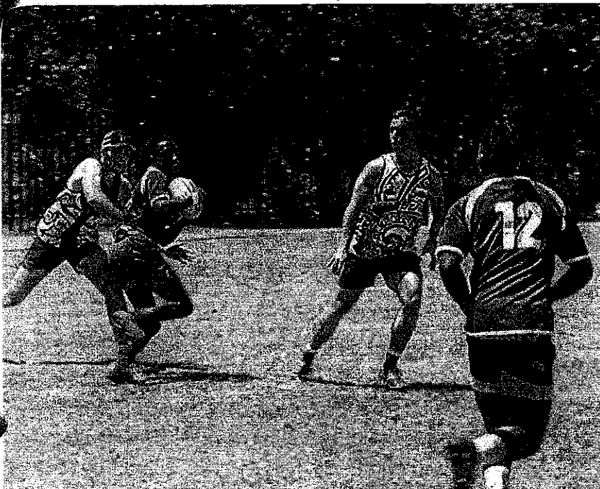
In play action at the recent Super Six Touch Champs, more of the same can be expected on May 28 at the Marks Park Sports Club.