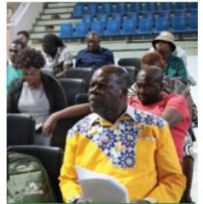
IDP REP FORUM MEETING 06