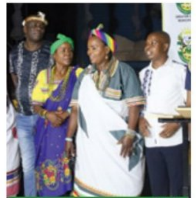
ARTS, CULTURE AND HERITAGE FESTIVITIES 15