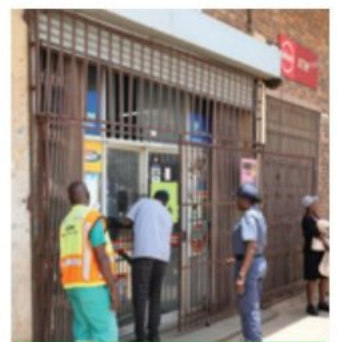
SPAZA SHOPS RAIDED 11